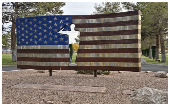
Row 1—Carlsbad; Row 2—Dana Point; Row 3, Lighthouse and top 2—Oceanside; Row 3, bottom 2— Murrieta; Row 4—Hoover Dam RR Trail, Boulder City Historic Town, and Boulder City Veterans Memorial Park.