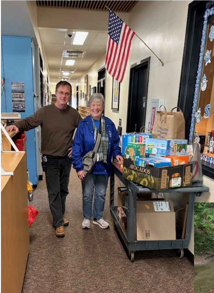
Garfield Elementary School principal gratefully receiving CVC Christmas donations. Since 2017 we have given supplies in support of the student body, half of whom live at or below the national poverty level.