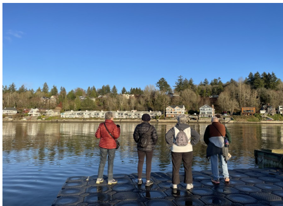
Olympia Waterfront Walk and Christmas Party Photos