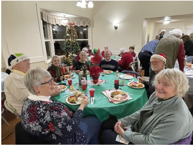
Christmas Party Photos continued and Tumwater Falls Photos — Gnomes and Gargoyles!!