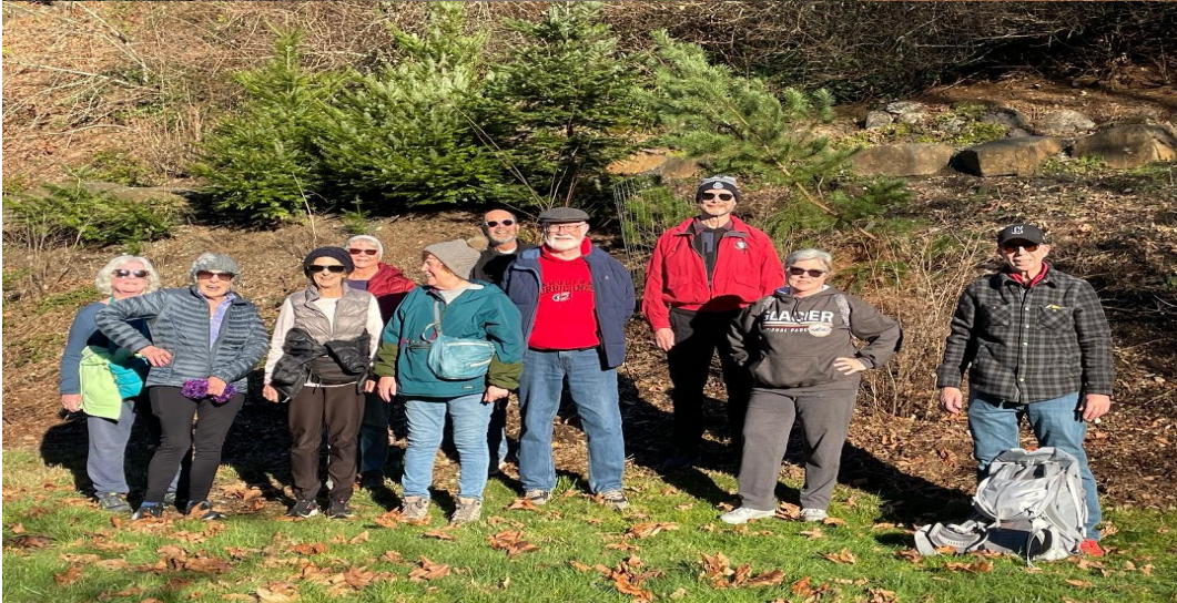
Group Photos: Top—Shelton 2nd row, right—Chehalis Willapa; left—Steilacoom in the fog Bottom—Olympia’s Eastside at Madison Scenic Park