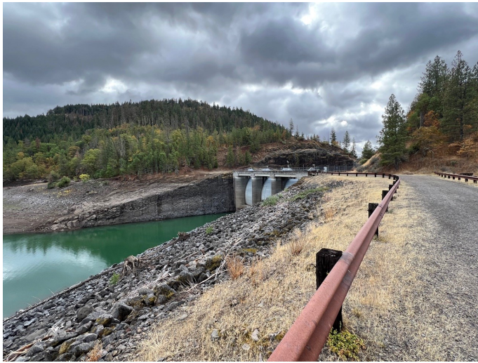
Shady Cove, OR— Oct 17-20