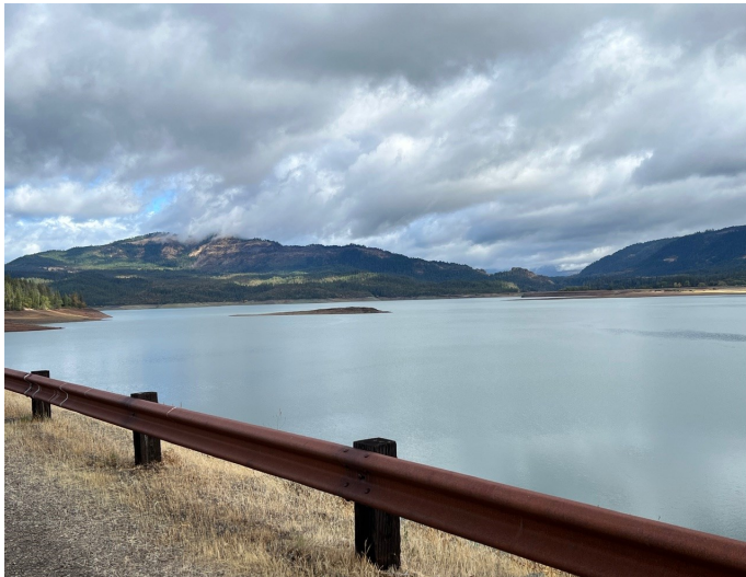
The walks were sponsored by CRVC / ROGUE VALLEY WALKERS.