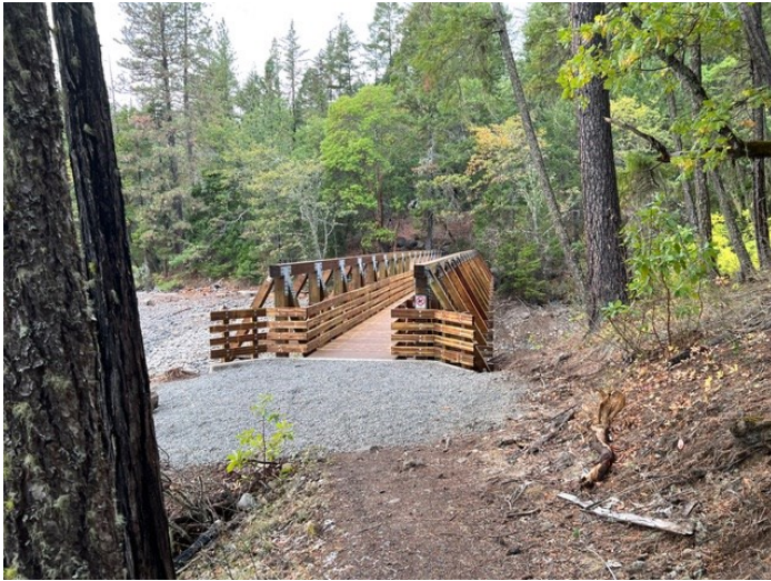
Blue Grotto Walk