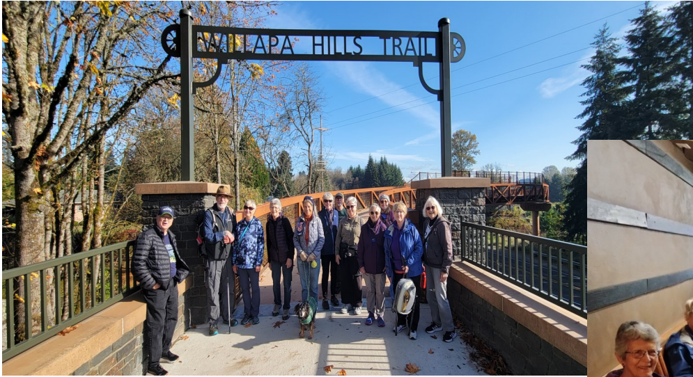
Chehalis Willapa Trail Walk 10/24/24 —group photo followed by lunch at Sweet Inspirations.