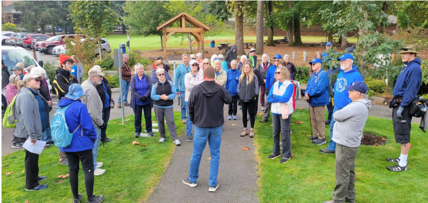
Salmon Run Walk 10-05-24 —Listening to Salmon Talk at Tumwater Falls/ Fishery Facility.