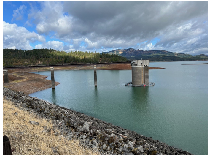
Dam Rumley walk across the Lost Creek Dam and around the east side of Lost Creek Lake.