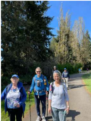
Walkers scouting Westside Nature Trails for Wild & Woody