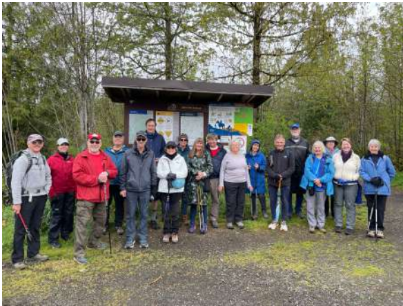
W & W walkers at Mima Falls