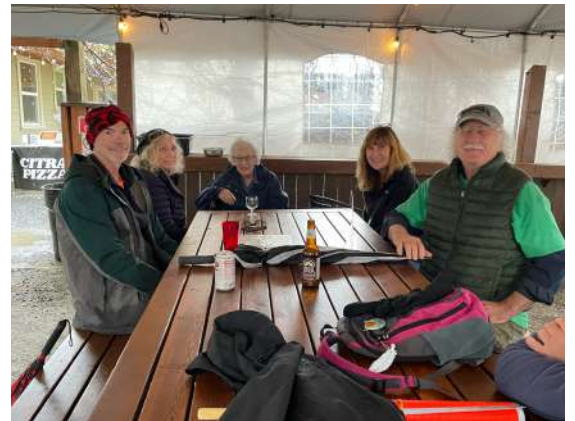
Socializing at the W & W dinner after a walk adds to the fun