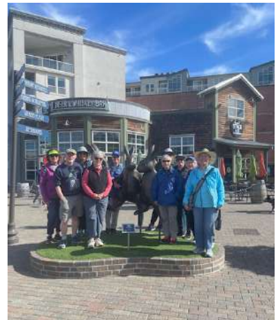
Tacoma Ruston walkers