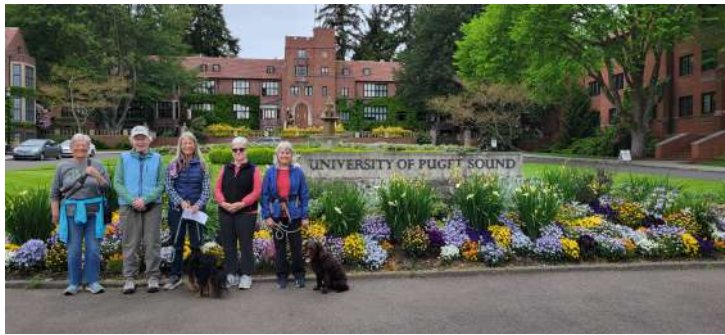
Tacoma walkers enjoy PLU flowers