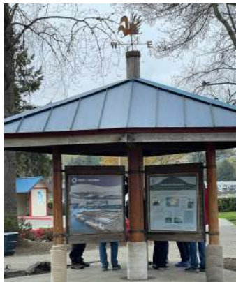
Who are those walkers?