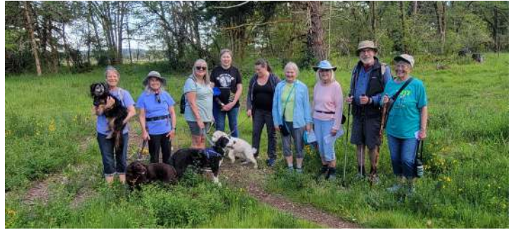
Beautiful afternoon at Scatter Creek