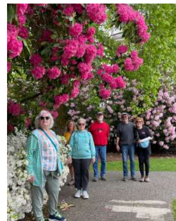
Spring Flowers treat walkers around the Olympia Capitol grounds.