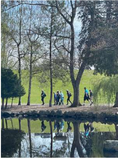
Point Defiance reflections