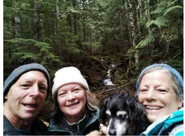
Big Smiles at Big Creek