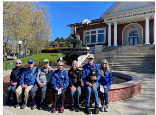
Sunny skies in Chehalis