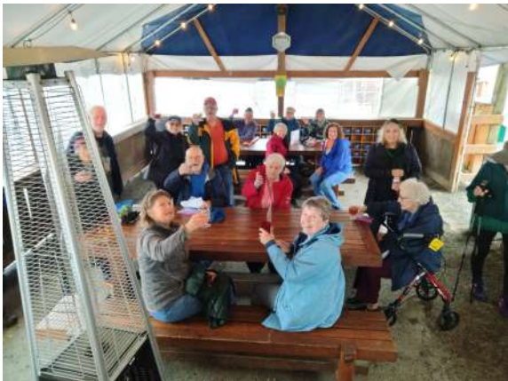
The rain didn't dampen spirits at the W & W Pub Crawl