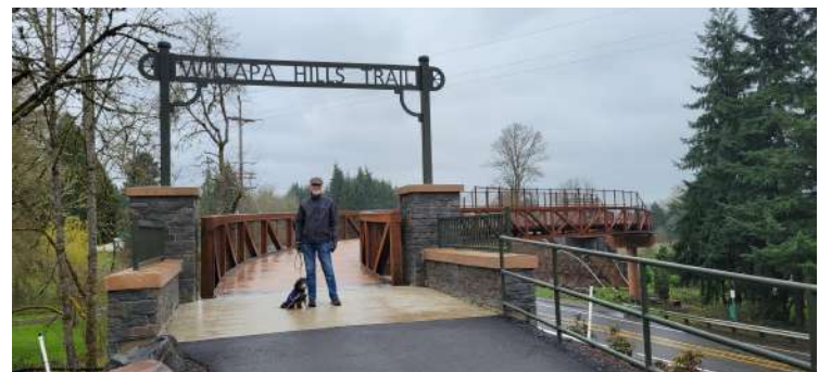
Willapa Hills Trail Bridge provides a safe and beautiful way to cross State Hwy 6