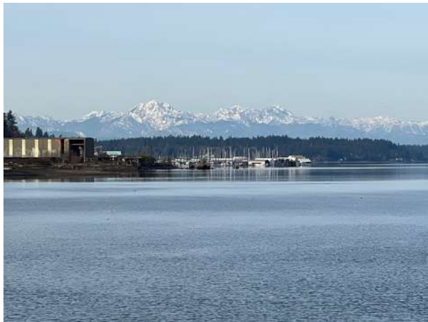
Snow-capped Olympic Mountains greet walkers coming down the Capitol switchback trail