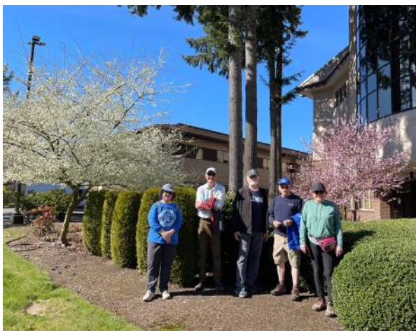
Walkers enjoy westside blossoms in Olympia