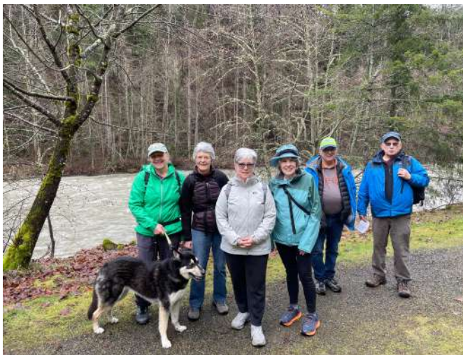
The White River Trail in Auburn provides a dramatic walking experience.