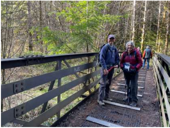
Lots of CVC members volunteered to proof walks for Wild & Woodsy at Mima Falls and Millersylvania.