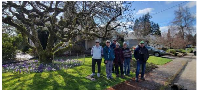
Spring crocus popping up in Tumwater