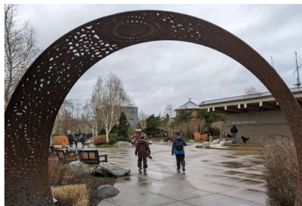
Walkers enjoy a rainy day in Olympia