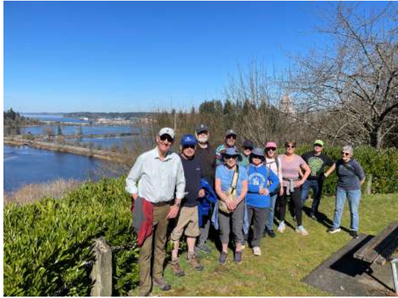
Beautiful views during the mid-March heat wave