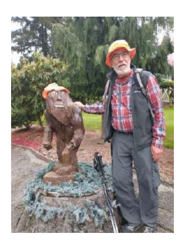
Hoquiam walkers take in views of Grays Harbor