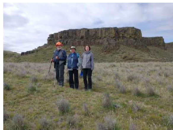
Othello event walkers appreciate the Eastern Washington landscapes.