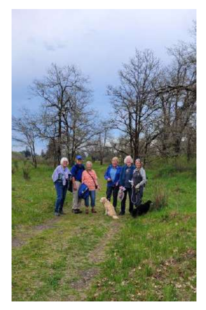
A lovely evening walk at Scatter Creek Prairie