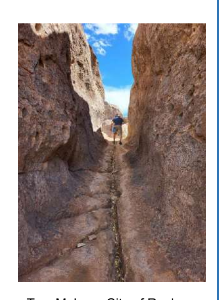
Tom Malone, City of Rocks

State parks start with the unusual City of Rocks (Grant County) with geologic formations up to 40 feet tall. One trail goes completely around the rocks and then invites you to wander through them. Another option is to hike up Table Mountain for the views. Farther south is Rockhound State Park (Luna Co) in the Little Florida Mts. Walk on trails or go off trail and collect and take some souvenirs. Don't miss the visitor center and displays.