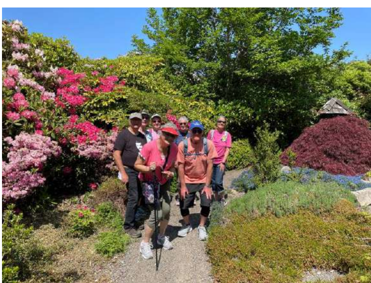
Enumclaw walkers enjoyed a beautiful walk that included the Anderson Rhododendron Garden.