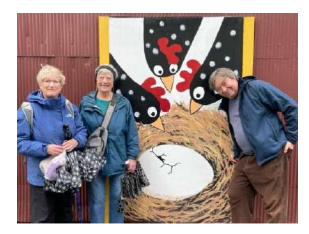
Smiling walkers in Winlock