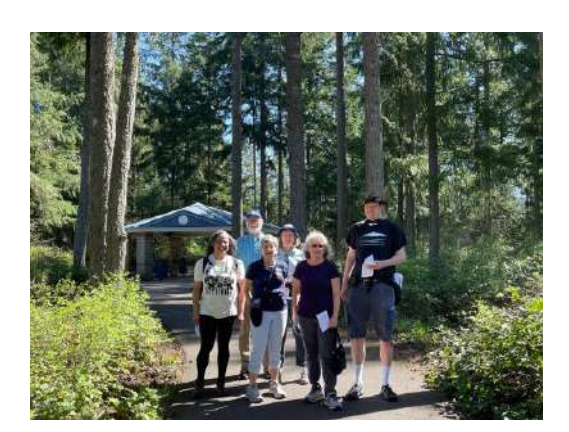
Earth Day walkers in Lacey.