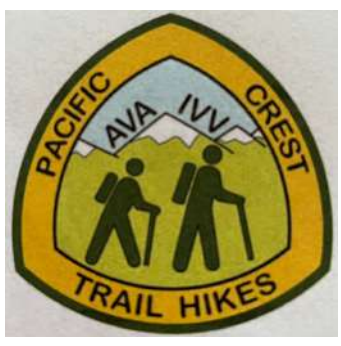
PCT Naches Loop Trail

https://vancouverventurers.com/walkfest-vancouver-2023/