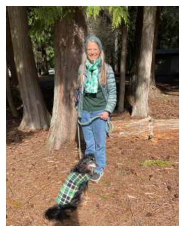
Steilacoom walkers enjoyed blue skies and views.