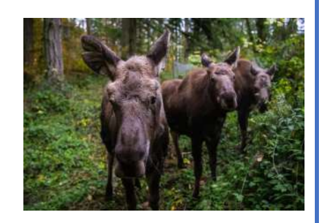
Meet Northwest Treks' newest residents, orphan moose from Alaska: Atlas, Callisto and Luna.

April 30 walk at Northwest Trek Wildlife Park near Eatonville on paved paths through the Northwest Trek. See amazing animals in their natural habitat. Start time: 9:30 am – 1:00 pm, Finish time: 4:00 pm. 5K & 10K routes available. Pre-registration is required for a group discount entrance fee of $15. Registration form is available at <a href="https://capitolvolkssportclub.org">https://capitolvolkssportclub.org</a>