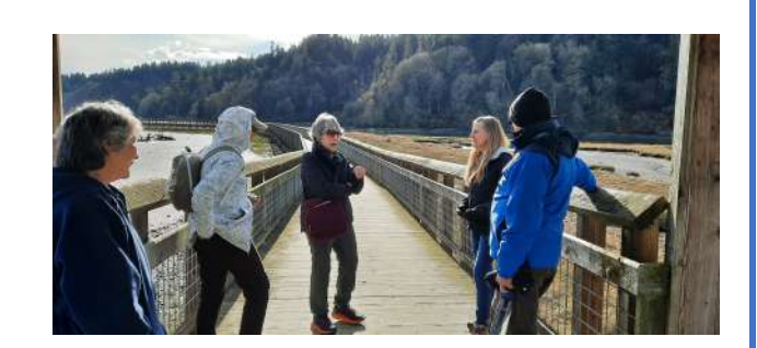
Nisqually on a sunny afternoon.