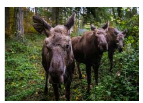
Meet Northwest Treks' newest residents, orphan moose from Alaska: Atlas, Callisto and Luna.

Lacey Earth Day Walks on April 29 -30, 2023