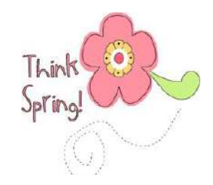
Point Defiance Park