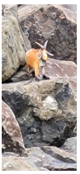
Aberdeen walkers discover a goat on the trail to check off on the Chinese Horoscope Challenge.