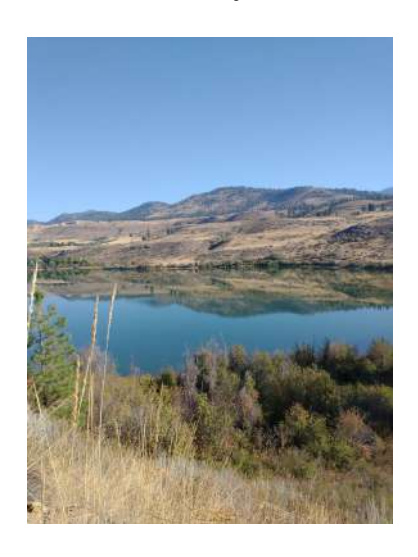
Pearrygin Lake and Lake Ann offered beautiful views near Winthrop.