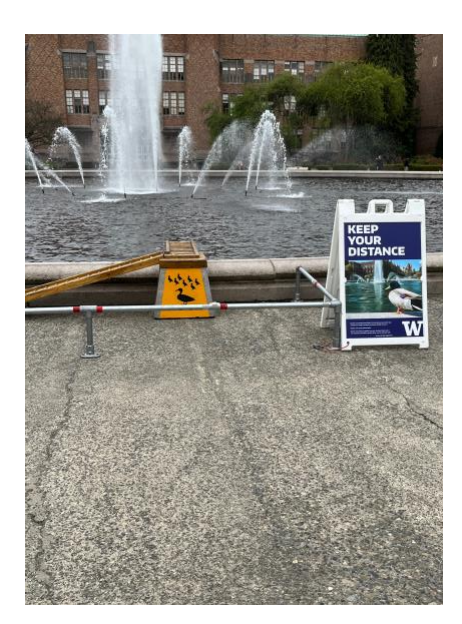
Walking assistance for ducks at Drumheller Fountain on the UW campus.