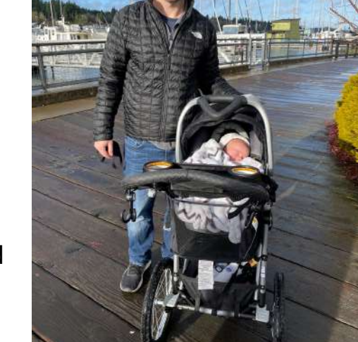
Our youngest walker & new member with his dad at the Holiday Walk.