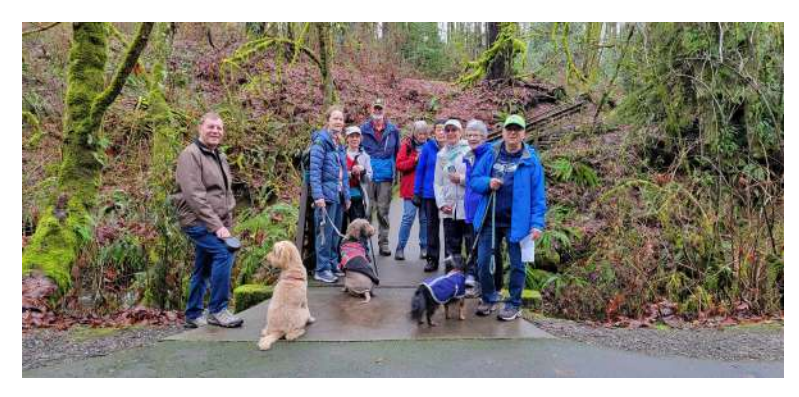
Des Moines Trail walkers with four-legged friends.