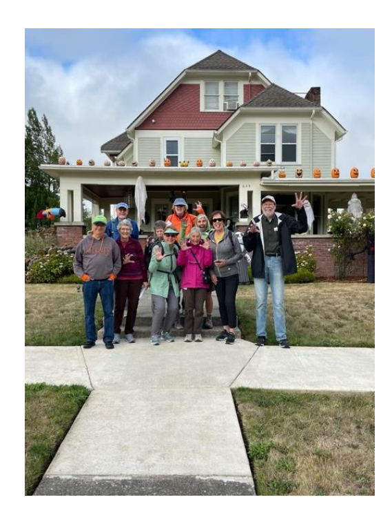
The Salute to Central Oregon in Bend, OR