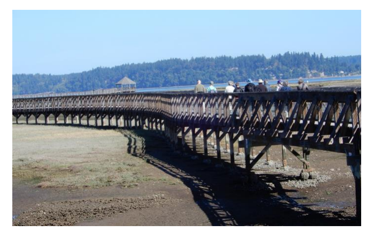
Proofing the Wild & Woodsy Walks: Staircase, Hawks Prairie Neighborhood, & Five Friendly Parks