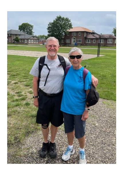
CVC members on June & July walks in our beautiful state...