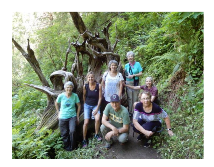
Montesano Town & Lake: Grays Harbor County Courthouse & the Lake Sylvia Trail