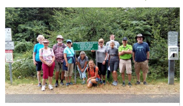
Tenino Town & Trail