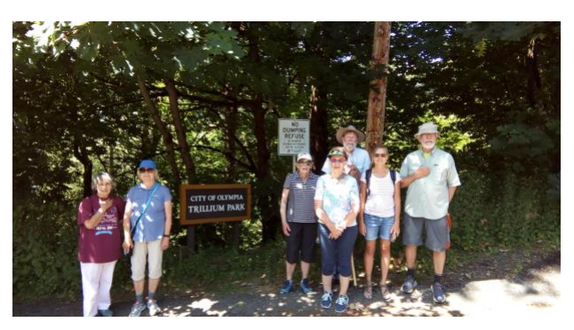
Tumwater Historic Parks