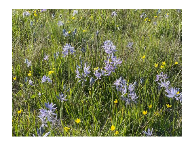
Exploring Evergreen State College