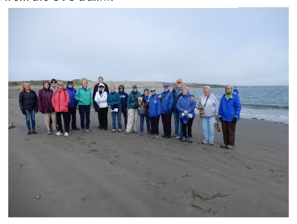
Fun at Westport