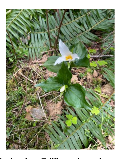
Springtime Trillium along the trail