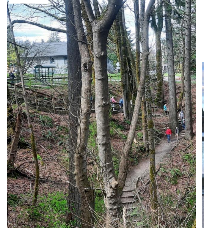
Monday walkers on the Garfield Nature Trail