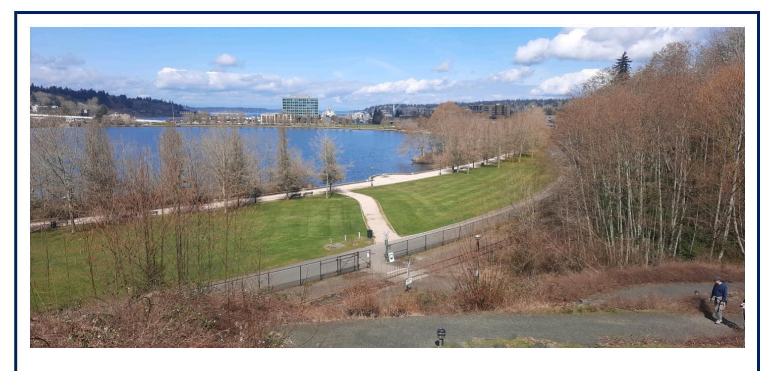
Switchback Trail is open again for walkers to enjoy.