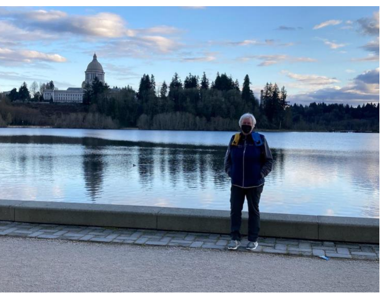
Beautiful Monday afternoon on Capitol Lake.