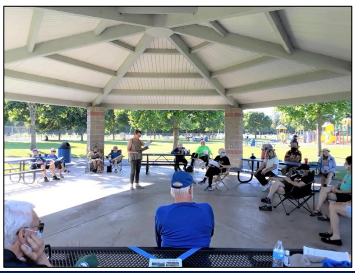
Right: CVC Meeting at Rainier Vista Park in Lacey, July 14