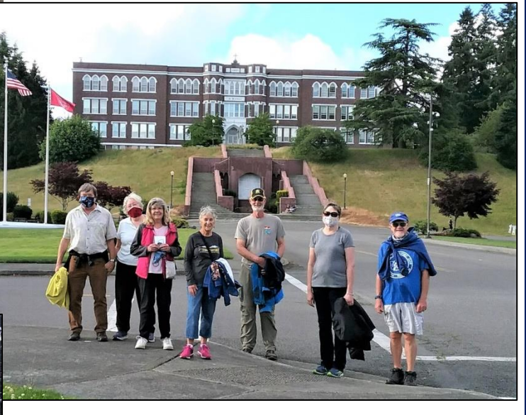
Left and Below: Olympia Historic Eastside And Mission Creek, July 9