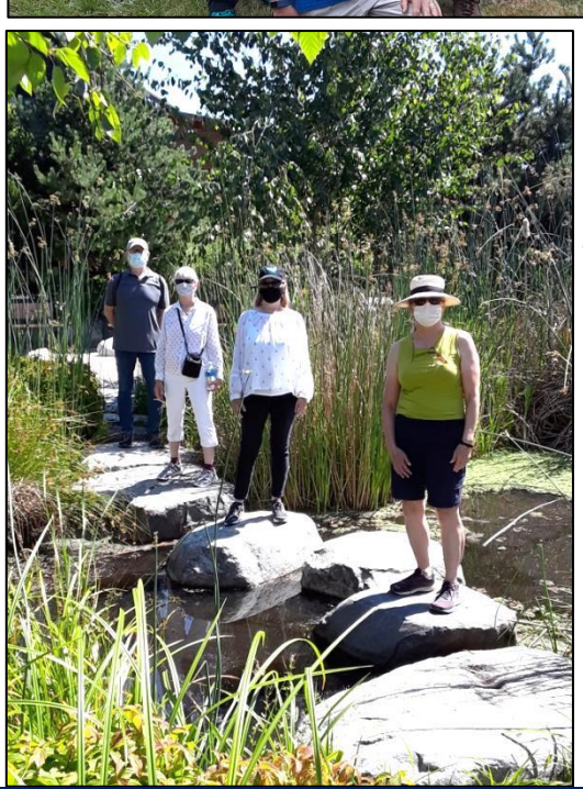
Left: Olympia Waterfront, July 13