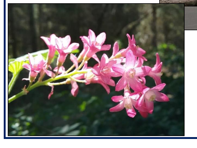
Spring Flowers Tenino Walk

Ocean Shores Beach Walk (Online Start Box!)