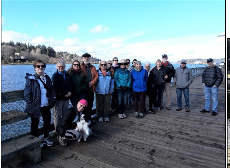
Monday, February 17 Olympia Waterfront