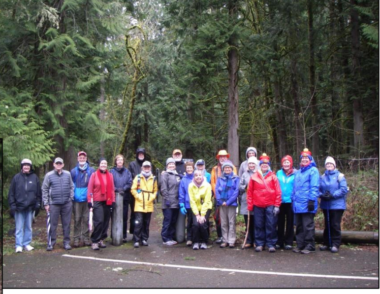
Above and Left: Thursday, February 13 Woodard Bay