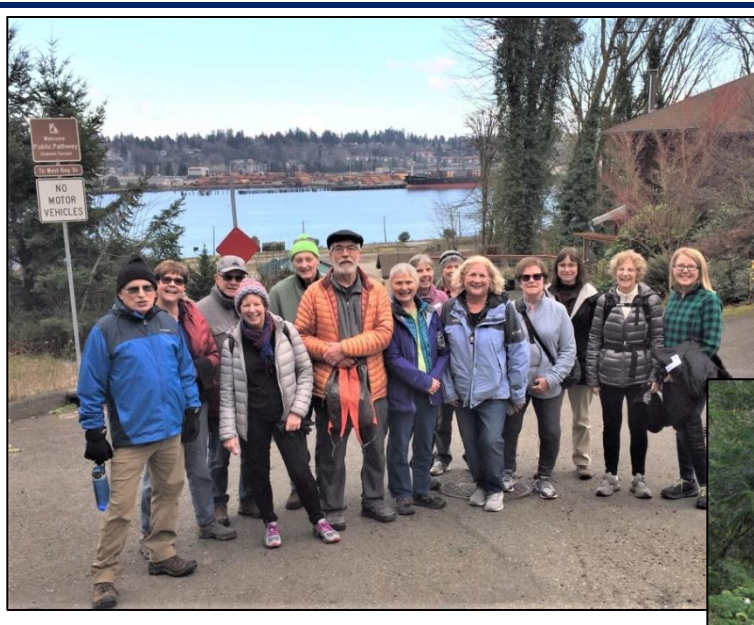
Monday, February 10 West Side Hills Walk - Olympia