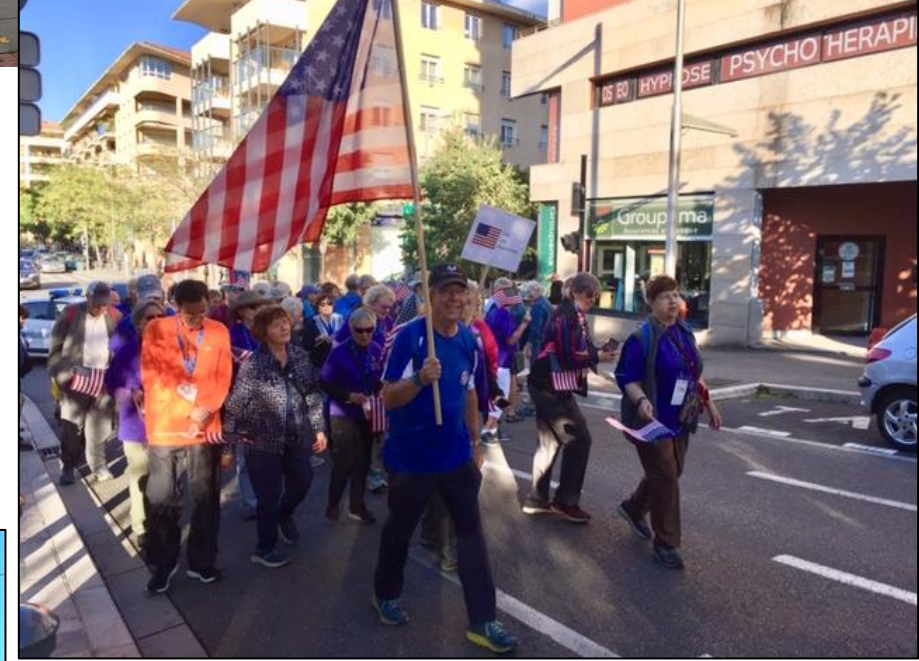
Left: Friday, November 29 Opt Out Walk Sumner, WA