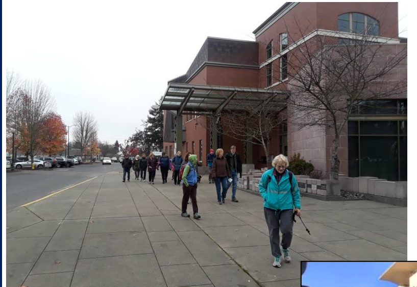
Left: Thursday, November 21 Puyallup