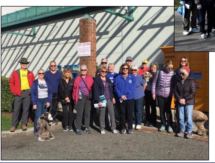
Thursday March 28th Puyallup