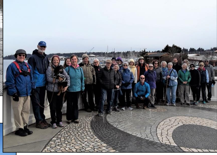
Above: March 14th Olympia