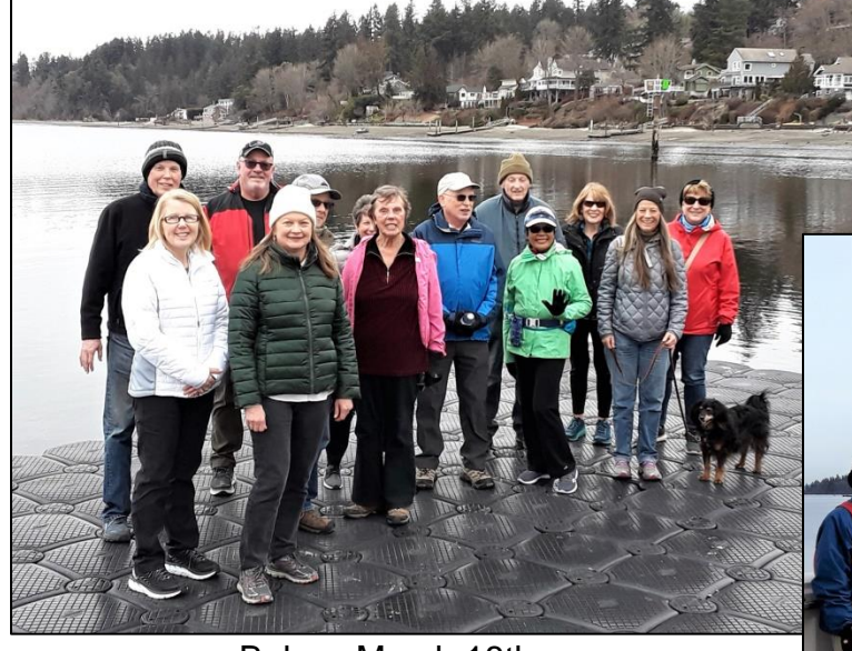
Below: March 18th