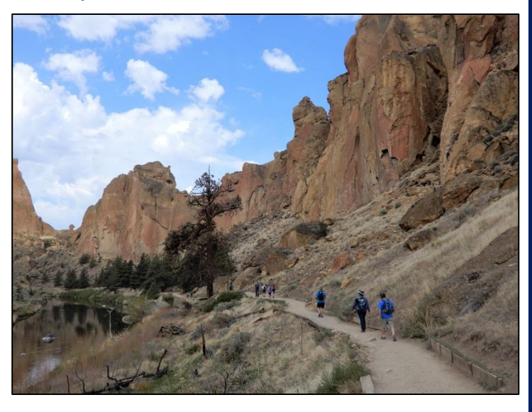
Front Cover of the 2019 Start Point