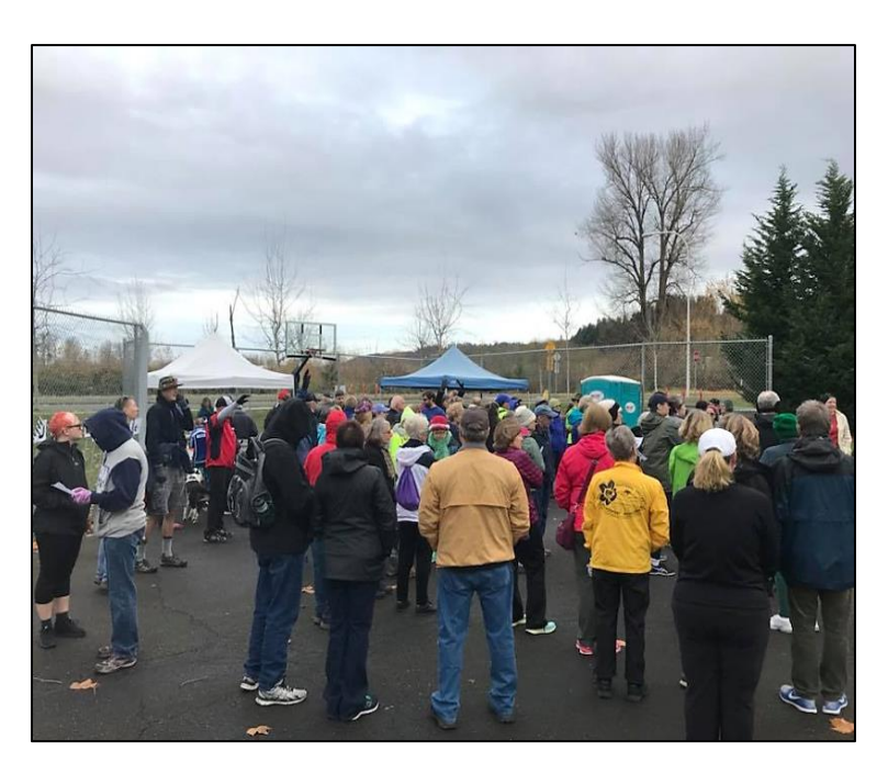
There was a great turn-out for last year's event!

Join the Daffodil Valley Volkssport Club and walk off all that Turkey you ate or are going to eat!