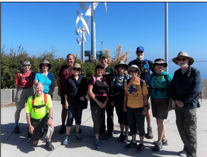
Lavender Farm Port Angeles Festival July 13-15