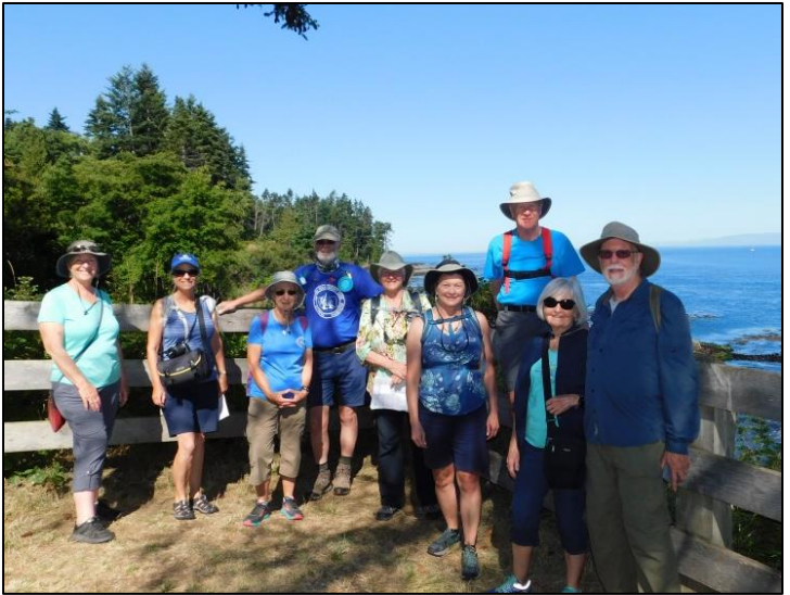
Port Angeles Walking Festival July 13-15