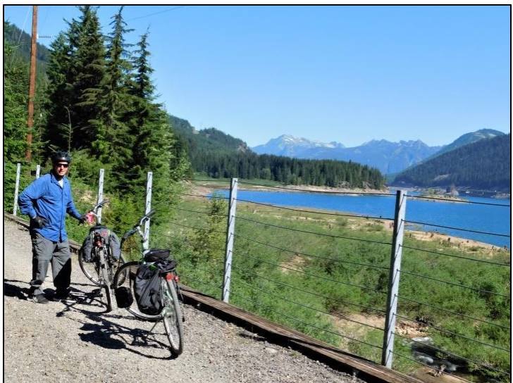
Iron Horse Bike Lake Keechelus, Hyak