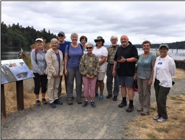
Woodard Bay July 18, 2018