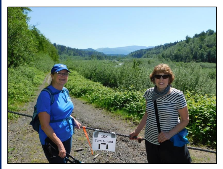
Just Another Dam Walk! - Enumclaw, WA 12 May