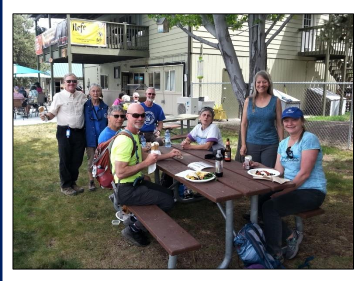
Willow Creek Canyon Walk - Madras, OR 5 May