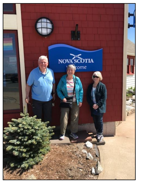
Canadian AVA Convention Nova Scotia 25-27 May