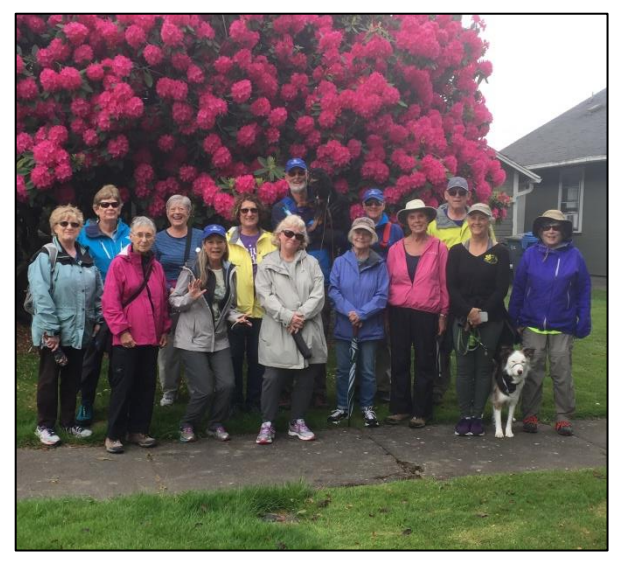
Thursday walk - Puyallup, WA 10 May

Smith Rock State Park - Terrebonne, OR 6 May