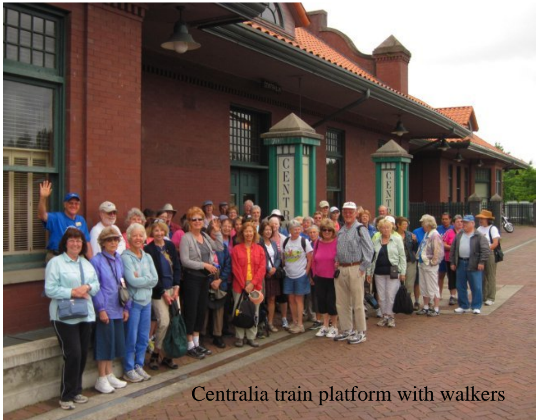
Centralia train platform with walkers